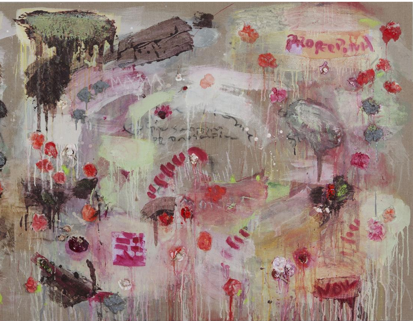
Proserpina , oil, acrylic, paper mache, poppies, rice paper, dirt, charcoal on linen, 48" x 120" (two parts), 2013