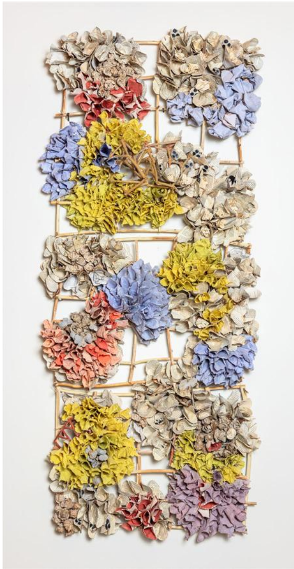
Yellow Lattice , fired and unfired porcelain paper recycled paper clay, handmade paper, organic material, 32" x 74" x 8", 2019