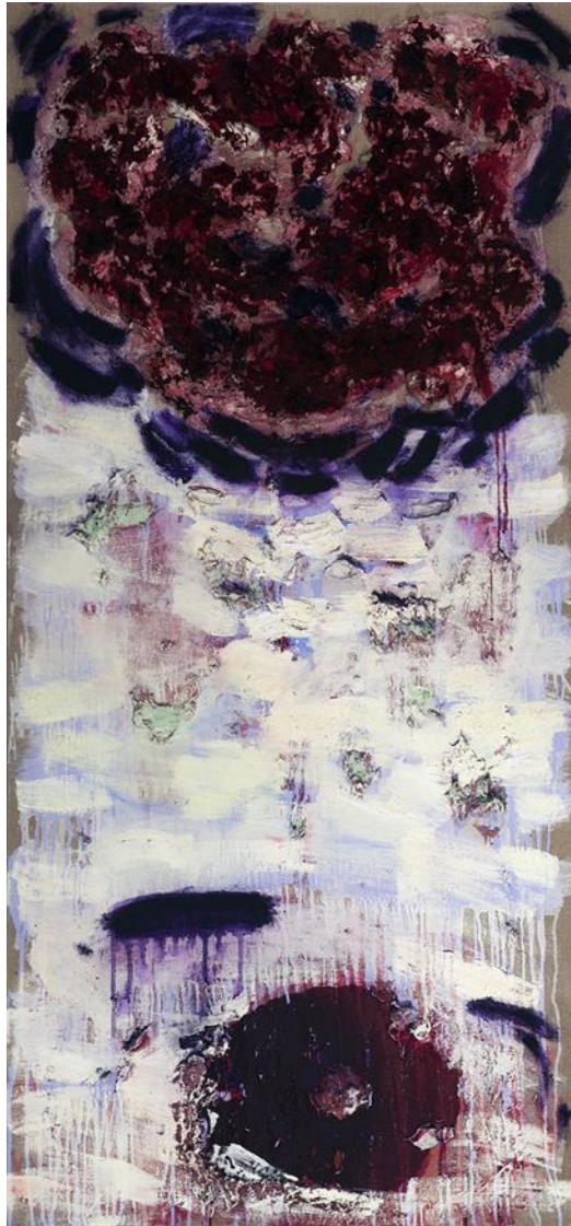
Winter Rose , oil, acrylic, paper mache, pastel, glitter on linen, 64" x 30", 2013