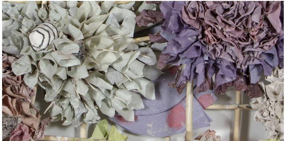
detail: Purple Overlap

Prominent collections which hold Hutchinson's work include: the National Museum of Women in the Arts, the Maldives Waldorf Astoria, the Boston Children's Hospital, the Yingge Museum (Taiwan), the Perlman Museum, the Georgia Museum of Art, and the Canton Museum of Art.