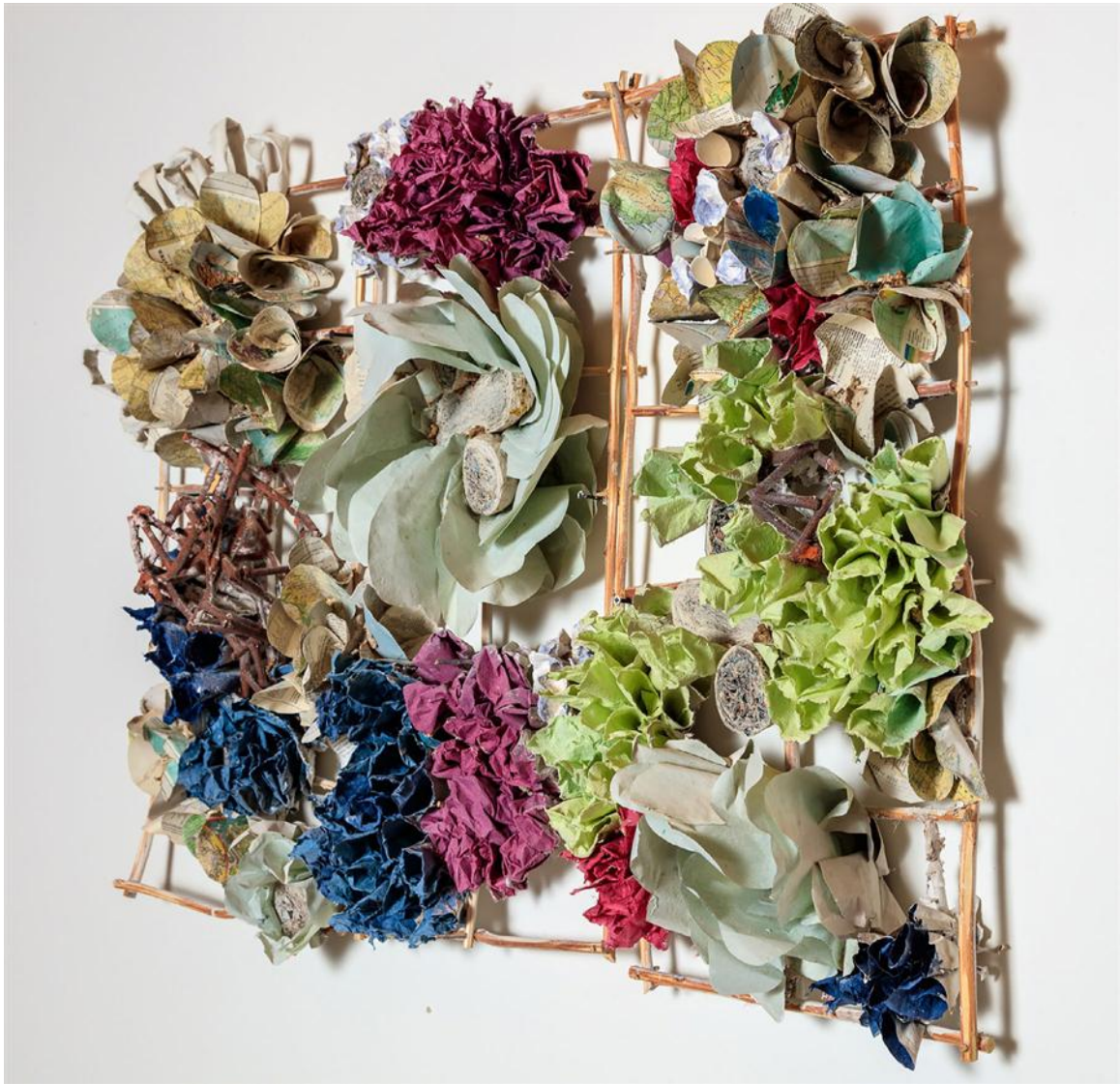
3 Slat Burst , fired and unfired porcelain paper clay, recycled paper, handmade paper, organic material, 54" × 36" × 7", 2019