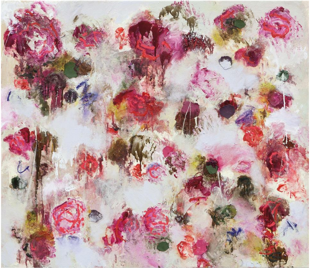
Come Spring , oil and acrylic on canvas, 40" x 46" 2015