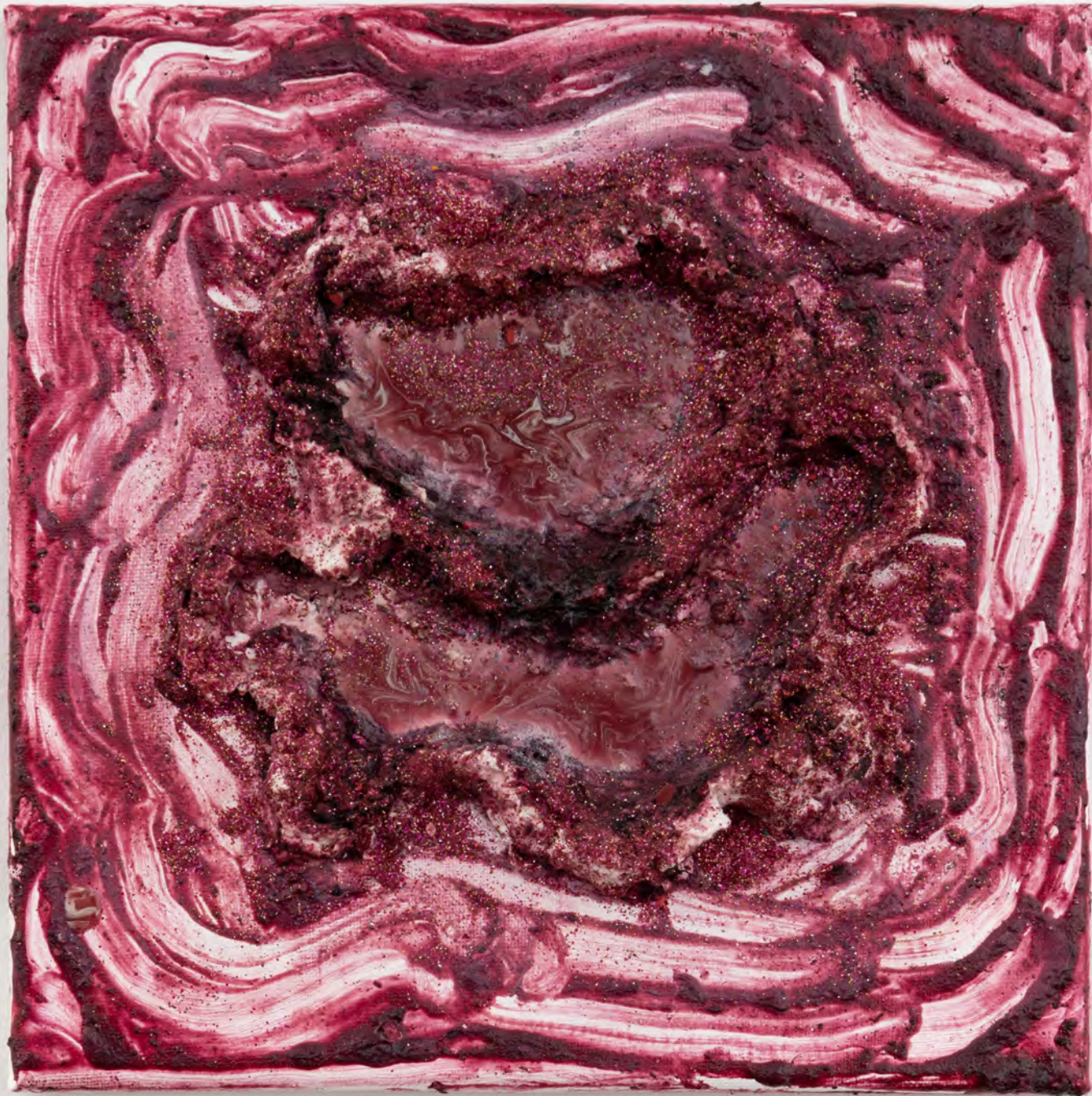
JOAN SNYDER Deep Little Rose , 2020 acrylic, paper mache, glitter on canvas 10 x 10 in | 25.4 x 25.4 cm