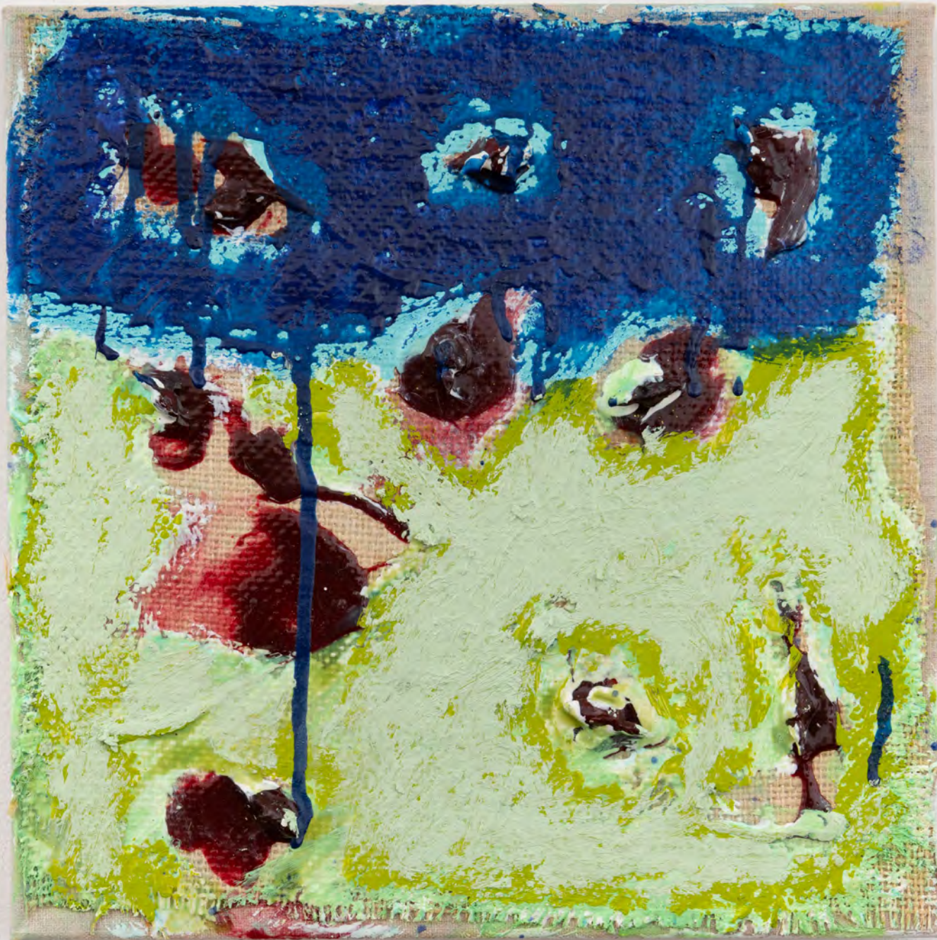
JOAN SNYDER Deep Blue Sky , 2019 oil, acrylic, burlap, rosebuds on linen 12 x 12 in | 30.5 x 30.5 cm