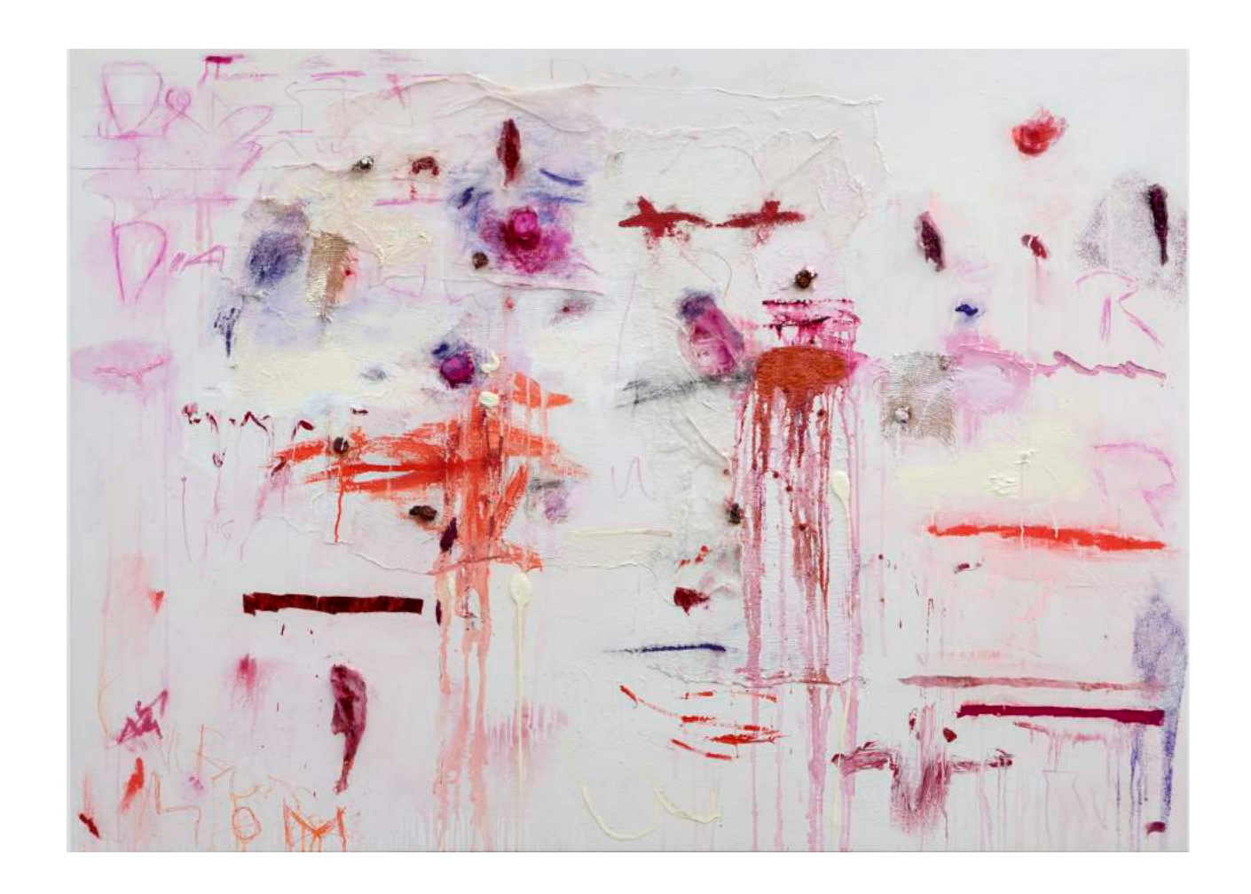
\label{lower} Love,\,Mom,\,2017 oil, acrylic, cloth, paper, colored pencil, pastel, beads, and glitter on canvas 52\,x\,72~in~|~132\,x\,182.8~cm