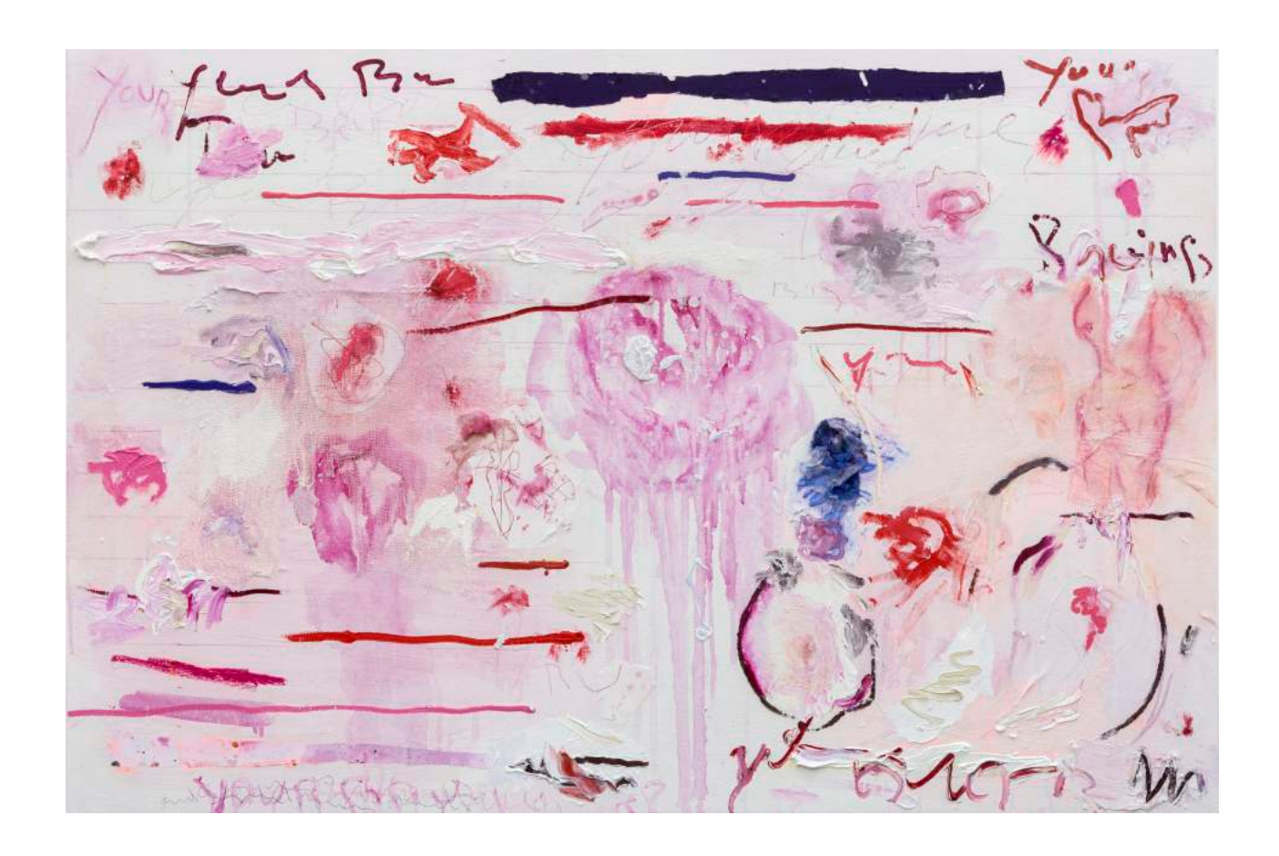
\label{localization} Joan Snyder $$Weeping/Magenta, 2017$ oil, acrylic, watercolor, paper, cloth, colored pencil, and pastel on canvas $$36 \times 54 \ in \mid 91.4 \times 137.1 \ cm