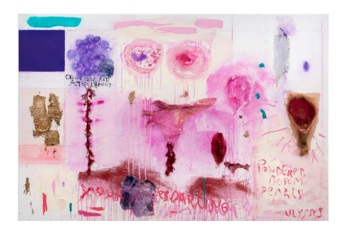
\label{eq:Joan Snyder} Fowdered\ Pearls,\ 2017 oil, acrylic, cloth, colored pencil, glitter, and beads on canvas 36\ x\ 54\ in\ \big|\ 91.4\ x\ 137.1\ cm