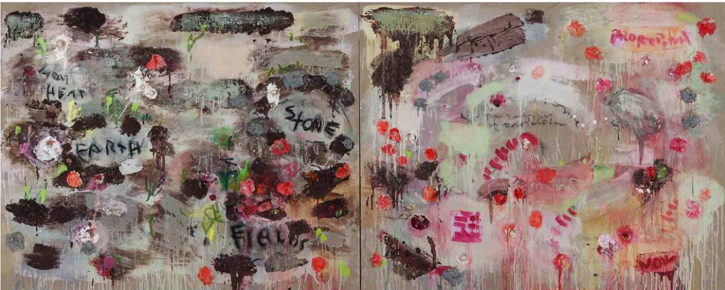
Joan Snyder 'Proserpina' (2013)

Art @ Blainsouthern , Mayfair Until Saturday May 11 2019 ★★★★★